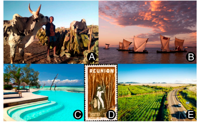
Fig. 4. Food insecurity, water scarcity, and rising energy demands case study illustrations: (A) a southern Malagasy herder provisions his cattle with prickly pear ( Opuntia spp.) fodder; (B) southwest Madagascar's Vezo seminomadic fishers sail traditional laka (outrigger canoes) at dusk; (C) freshwater infinity pool at a luxury tourist resort on the Zanzibar Archipelago; (D) vintage postage stamp from Réunion featuring a plantation worker harvesting sugar cane; and (E) an aerial view of sugar cane plantations on Mauritius ( Saccharum officinarum ).

Since the prickly pear's introduction to Madagascar from the Americas by French colonialists in 1769, southern "cactus" pastoralists have tightly integrated it into their ecology (44) (Fig. 4A). In the 1930s, however, the French colonial administration waged biological warfare on southern Malagasy by dispersing parasitic cochineal larvae ( Dactylopius tomentosus ) to eradicate the prickly pear (45). This attack was framed by the French as a measure to civilize the south, disrupt a way of life deemed unproductive and prone to failure, and force southerners to adopt "modern" agropastoral practices through the cultivation of cash crops, irrigation, and improvement of grasslands (46, 47). As a result of the eradication of raketa gasy ( Opuntia monacantha ), the preferred prickly pear, imminent drought was followed by widespread famine,