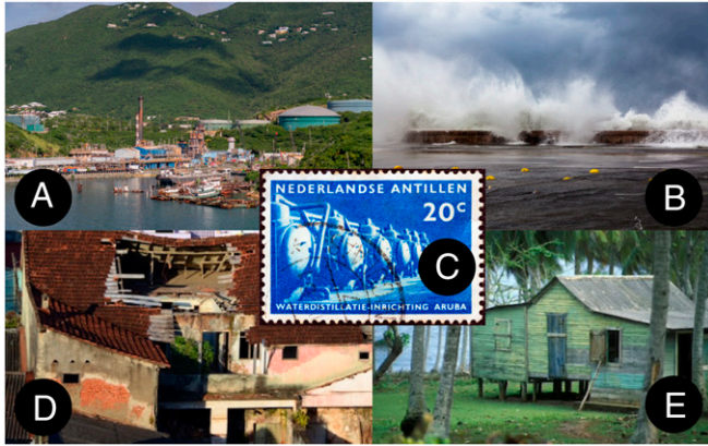
Fig. 3. Sea-level rise, hurricane events, and precipitation variability case study illustrations: (A) water desalination plant, St. Thomas, US Virgin Islands; (B) waves crashing against sea wall, Havana, Cuba; (C) vintage postage stamp from the Dutch Antilles featuring a water treatment facility; (D) hurricane damage to a concrete house, Baracoa, Cuba; and (E) traditional wood house made primarily of locally available materials, Las Terrenas, Samana, Dominican Republic.

household architecture and building materials have increased the relative vulnerability of post-Columbian communities to hurricane-related flooding and wind shear. Current disaster management strategies are predominantly based on robustness and resistance to hurricane wind shear, storm surges, and flooding events. This approach gives primacy to preventing damage through a strong built environment in total contrast with preexisting indigenous frameworks for resilience that focused on speed of recovery. Today, reinforced concrete is normally considered hurricane-resilient architecture in the Caribbean (Fig. 3D). A thousand years ago, resilient architecture facilitated swift posthurricane reconstruction using locally available materials, privileging the ability to swiftly rebuild and recover over attempts to be robust and withstand a hurricane's destructive impact (19) (Fig. 3E).